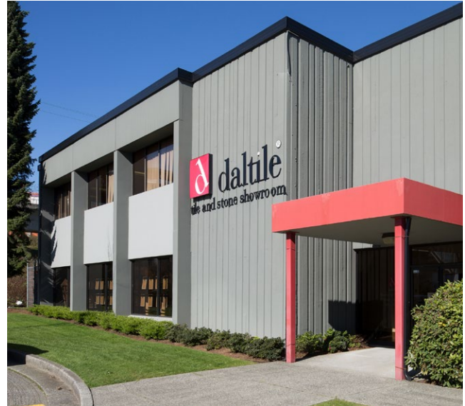
2770 Bentall Street, Vancouver, BC

CIP is pleased to recently renew a 58,710 square foot tenant at 2770 Bentall Street in Vancouver, BC. The property accommodates both industrial and office use in an amenity rich area between Lougheed and Grandview Highways, providing excellent access to Highway 1. The location is also walking distance to Rupert SkyTrain station.